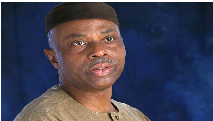
Governor Olusegun Mimiko of Ondo State

By Oluwaseun Akingboye, Akure | 21 October 2016 | 3:08 am