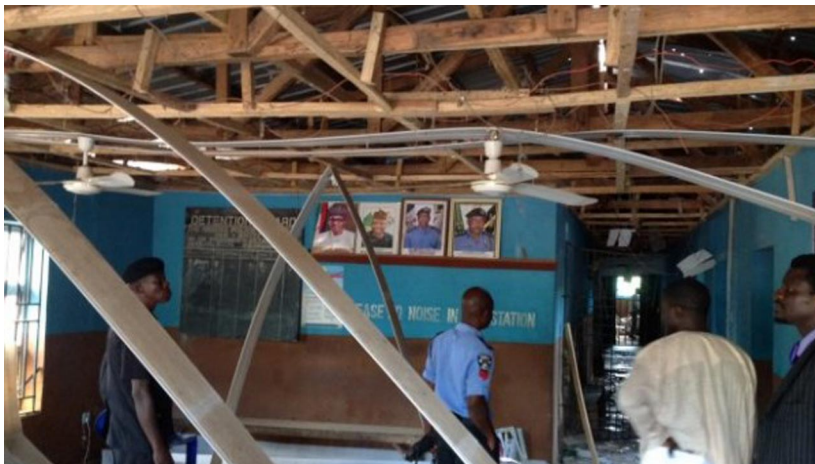
The Police station