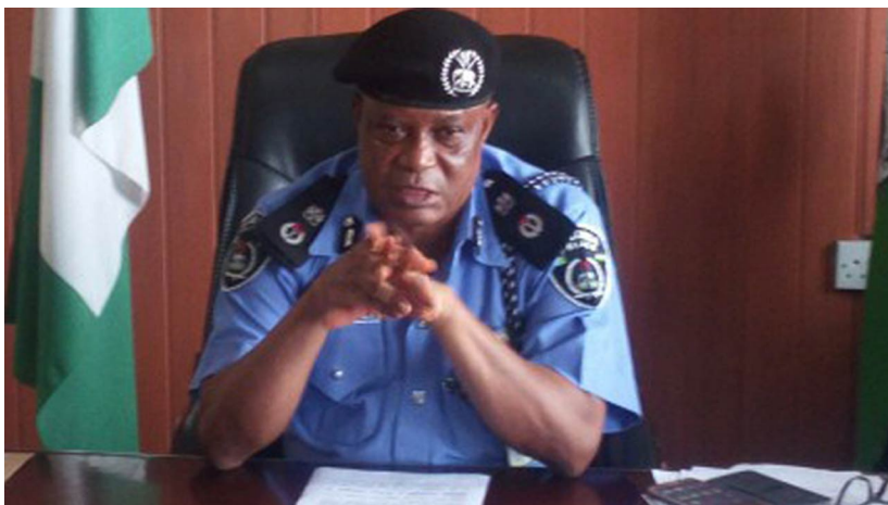
Cross River State CP. Jimoh Ozi-Obeh

By Anietie Akpan and Tina Todo Calabar | 13 October 2016 | 1:15 am