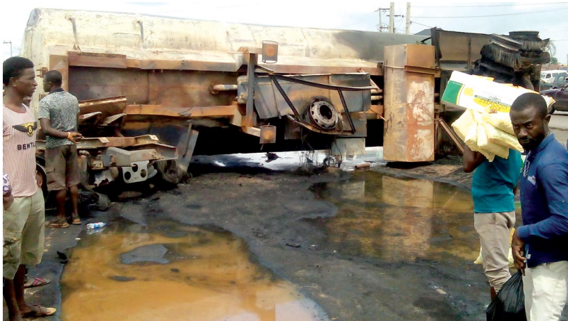
The burnt tanker

By Alemma-Ozioruva Aliu, Benin City | 25 August 2016 | 3:28 am