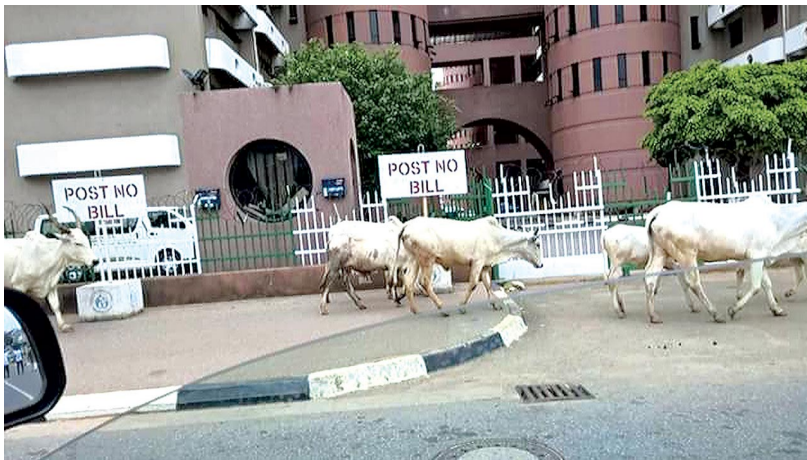
Cows in front of the office of Head of Service, Federal Secretariat, Abuja