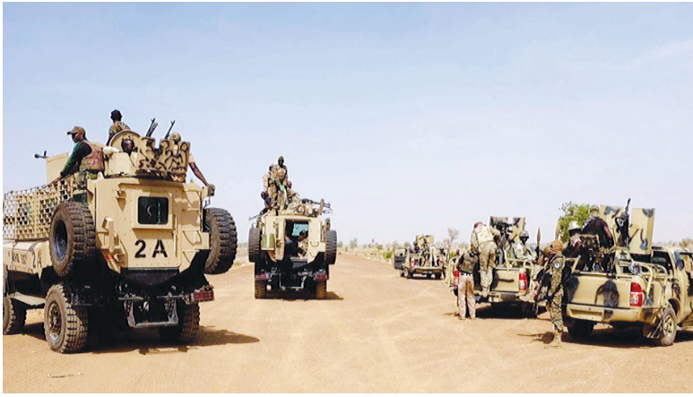
Soldiers of the Nigerian Army penetrating Sambisa forest, the strongholds of Boko Haram insurgents in Maiduguri.

Soldiers attached to Operation Lafiya Dole have rescued eight persons, recovered N466,000 from fleeing Boko Haram terrorists and resettled 134 others in Internally Displaced Persons (IDPs) camp during a search and rescue exercise in North East where the task force is currently moving to dislodge the last of the remnants of the terrorists.