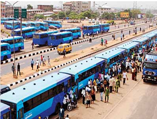
Some BRT buses plying the route

THE scene was grisly. The mangled remains of a commercial motorcyclist on the Bus Rapid Transit (BRT) lane at Agric Bus Stop, Ikorodu, Lagos was the cynosure of all eyes and cause of a severe gridlock that almost grounded traffic into and out of Ikorodu.