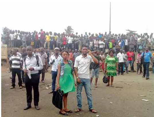
Some of the traders at the market

THE fragile peace that was brokered last week between traders at the Ladipo Auto Spare Parts market and some hoodlums claiming to seize ownership of a section of the market known as Odo Aladura community was shattered yesterday as traders went on rampage, shutting down the market.