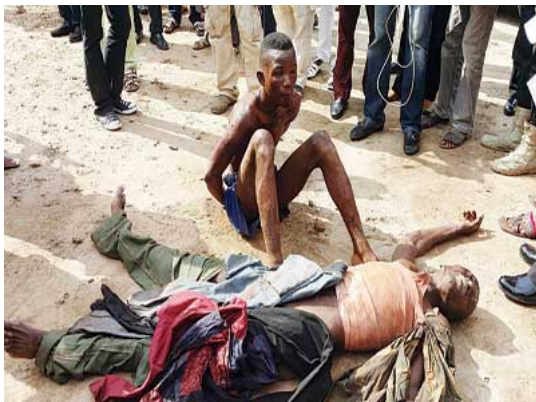
The kidnap suspect.

By John Akubo, Lokoja and Anietie Akpan, Calabar on September 21, 2015 4:03 am