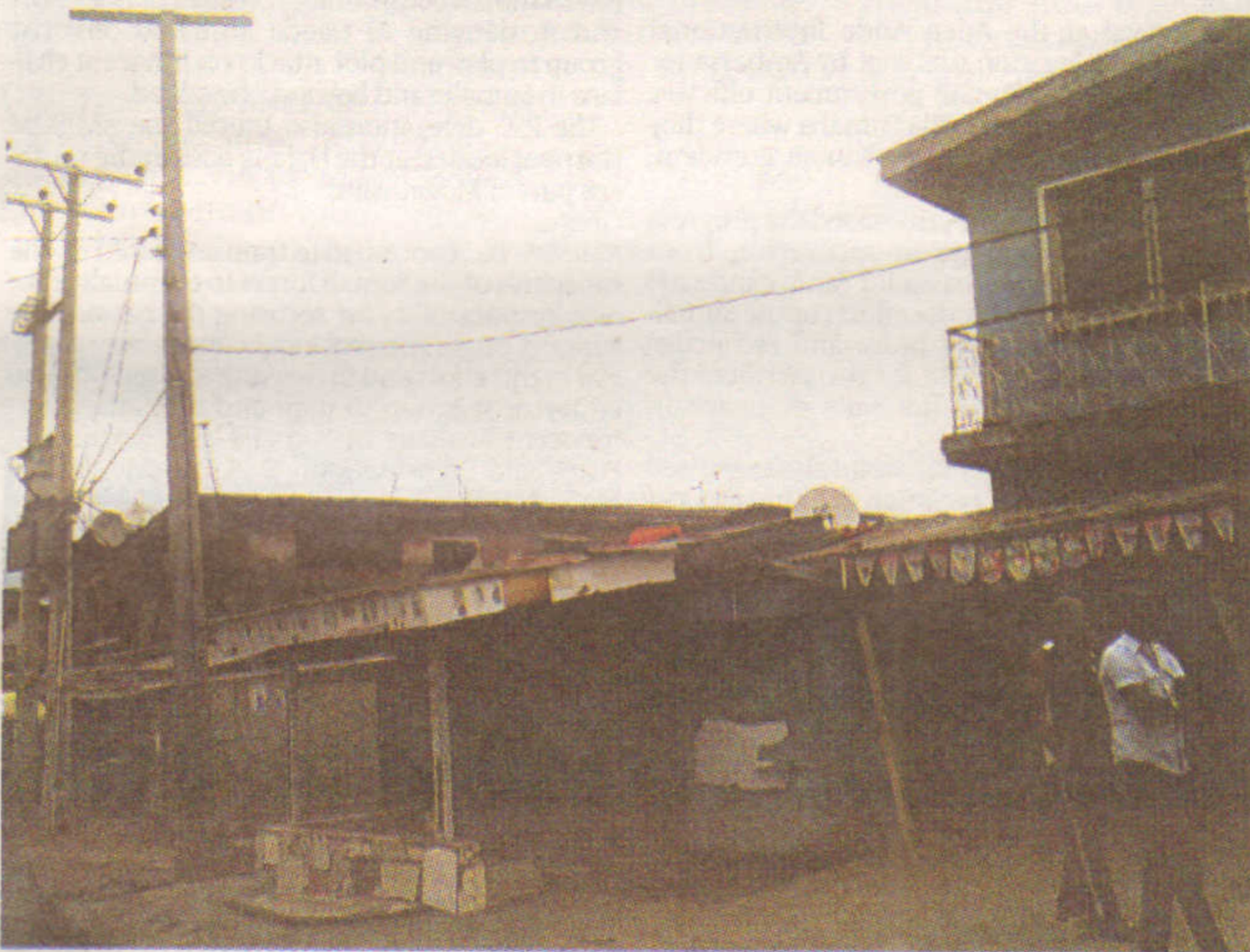
House 88, Oniwaya Rd, off Capitol Agege where the victims were electrocuted.