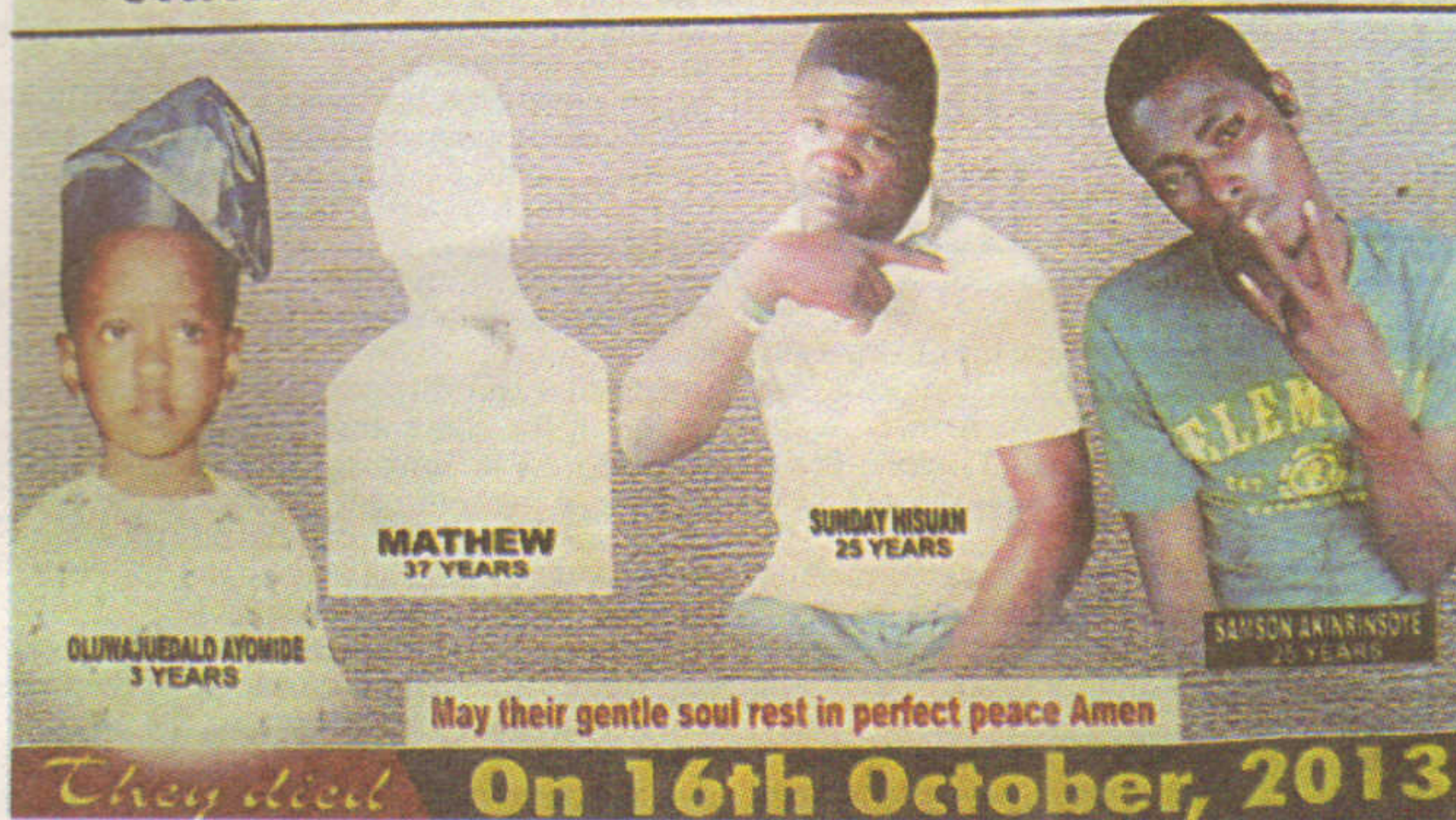
Poster of the electrocuted Agege residents

THOSE ARE THE PEOPLE DEAD BY ELECTROCUTED AND THIS IS THE CAUSE OF BAD PLANNING ELECTRICITY IN THE ENVIRONMENT ESPECIALLY ONIWAYA JUNCTION AGEGE LAGOS STATE