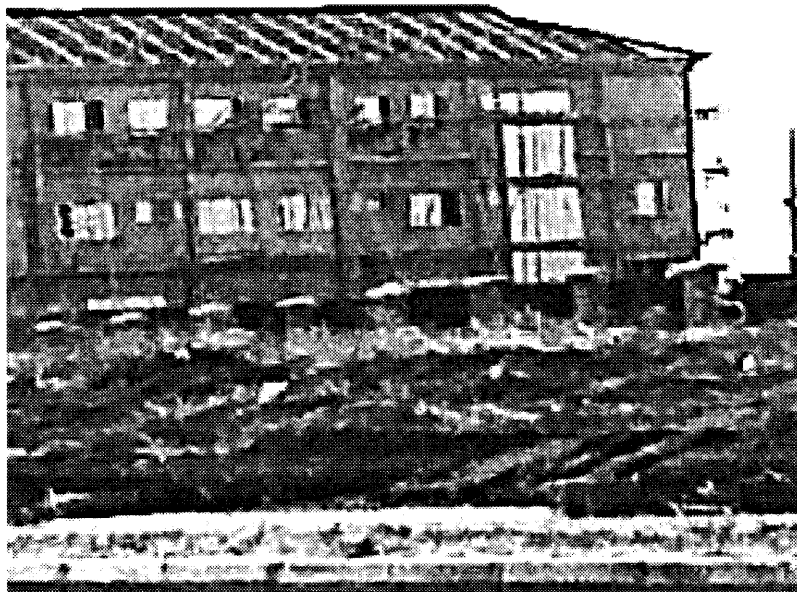
A house destroyed by the rain