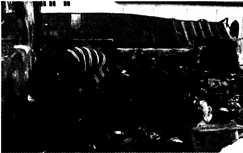
A victim sifting through the rubble