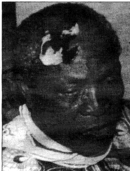
• The late Komolafe

• A disagreement at a fuel station results in the death of a 72-year-old man