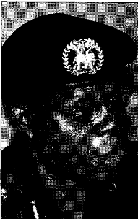
• Acting Inspector General of Police, Mr. Mike Okiro