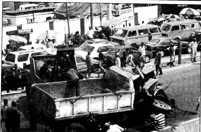
• An accident scene at Five Star Bus Stop, Oshodi-Apapa Highway yesterday aggravated the chaotic traffic situation in Lagos. It affected all feeder roads for several hours.