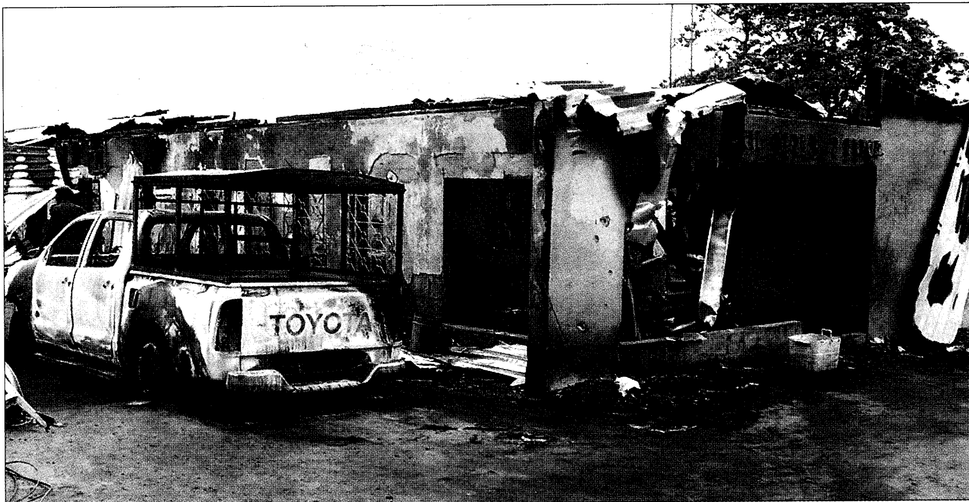
Elenwo Police station after the attack ... yesterday.