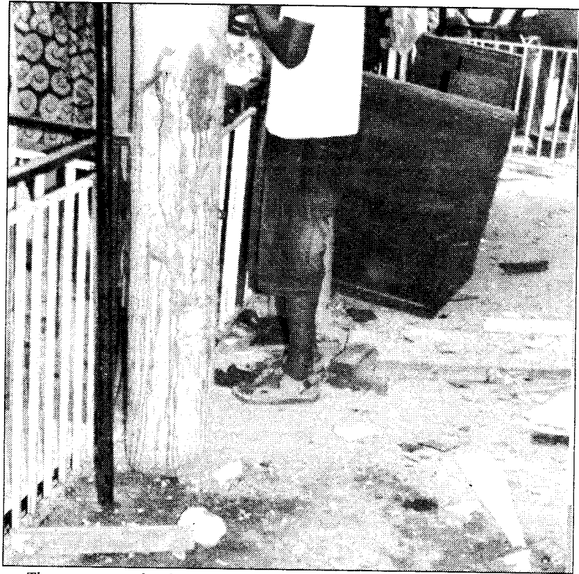
• The entrance to the church where he was reportedly killed