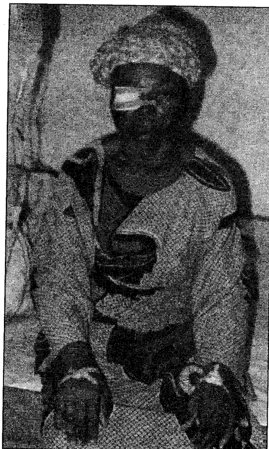
• During hospitalisation after being beaten by the assailant