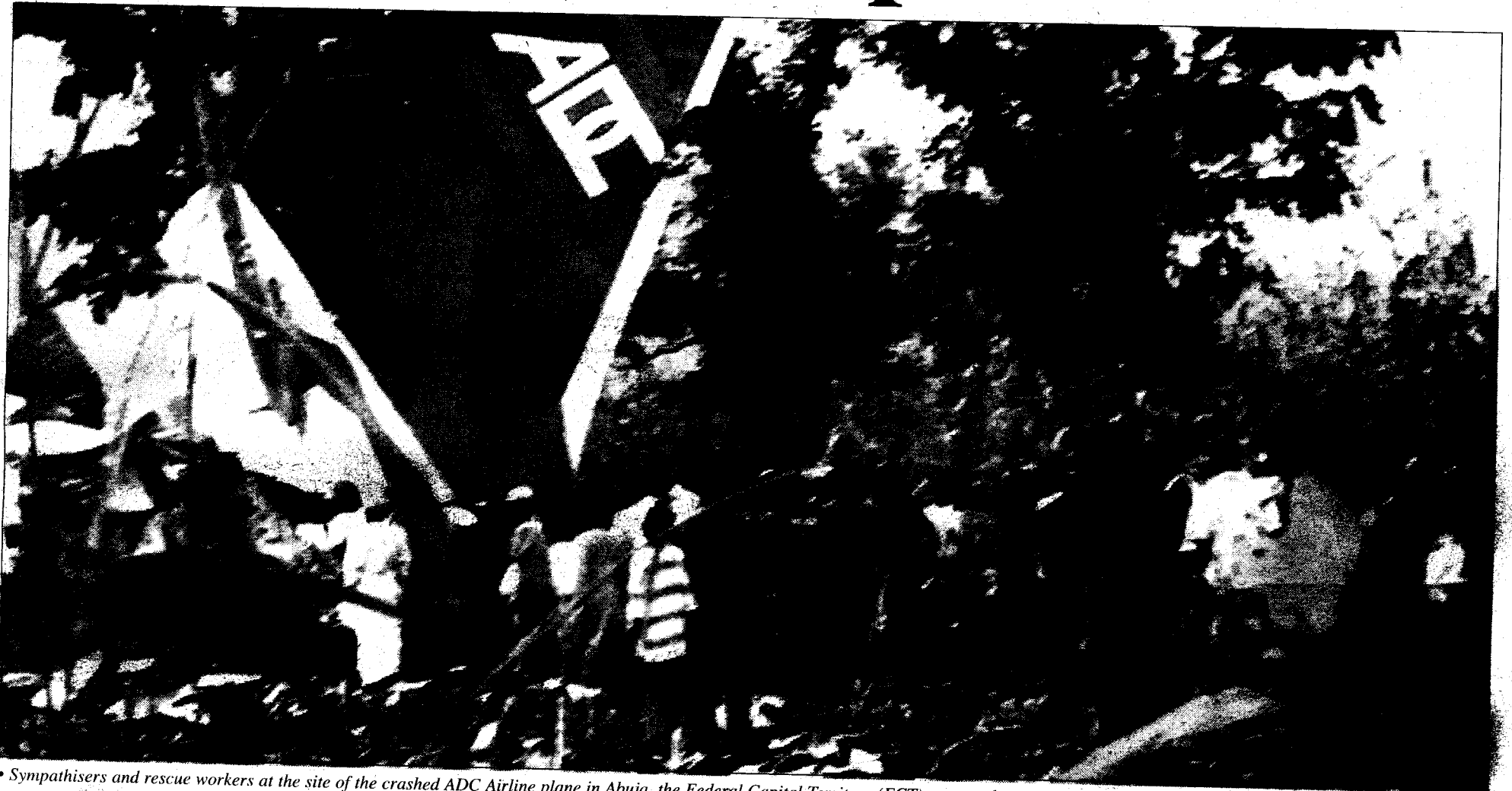
• Sympathisers and rescue workers at the site of the crashed ADC Airline plane in Abuja, the Federal Capital Territory (FCT)... yesterday.