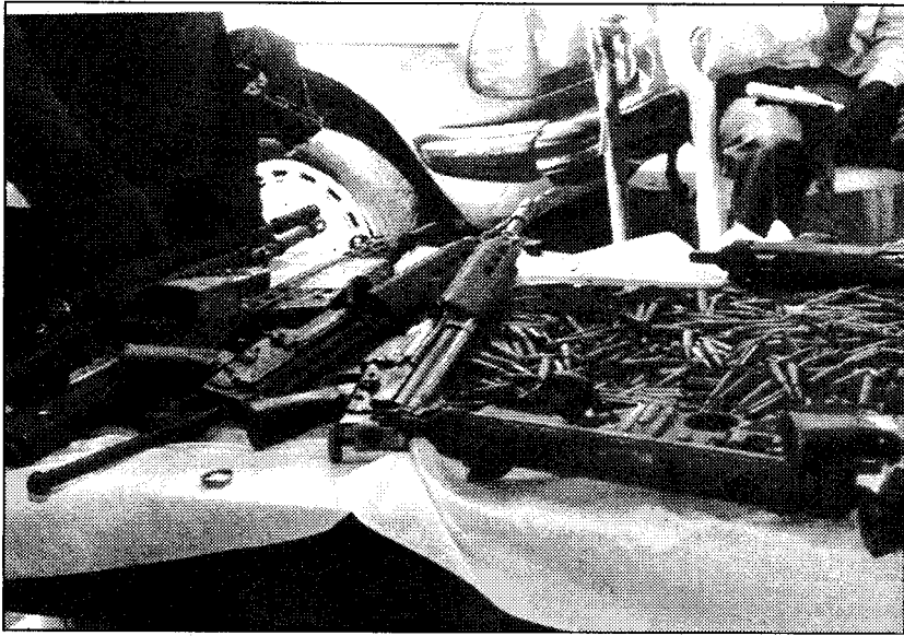
• Arms and ammunitions recovered from robbers in... Lagos recently

...Lagosians lament rising cases of violent crimes, demand frequent police patrol