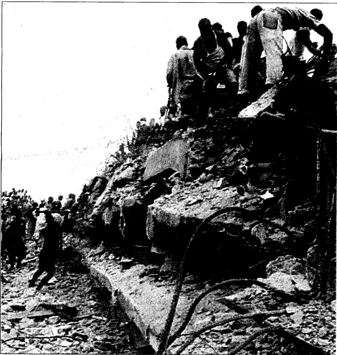
• Searching for survivors... yesterday. (More stories and photos on Page 13)