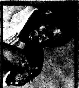
Last eight crew members of ship M.T. Tana, which exploded in Lagos, were rescued.

Telecom firms in Lagos den over erection of masts, towers