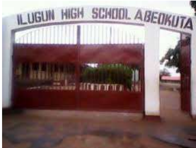
Ilugun High School, Elega, in Abeokuta, Ogun State