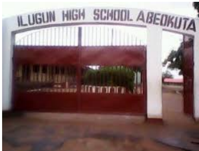
Ilugun High School, Elega, in Abeokuta, Ogun State