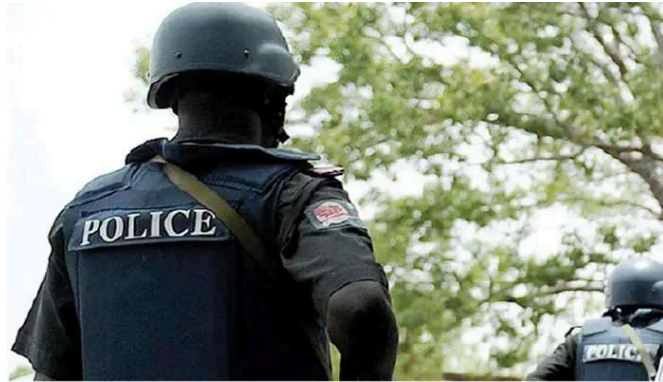
A Nigerian Police Officer