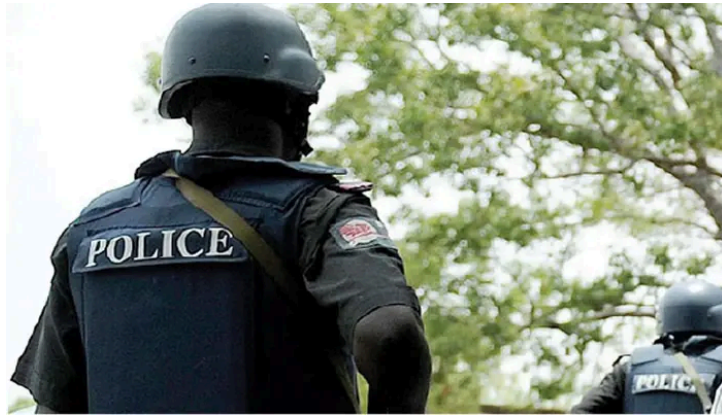
A Nigerian Police Officer