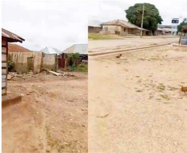
A community deserted after an attack on Ifelodun LGA of Kwara State recently