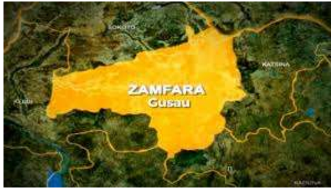
Zamfara state map