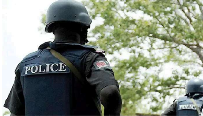
A Nigerian Police Officer