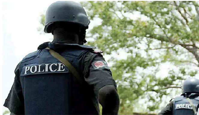
A Nigerian Police Officer