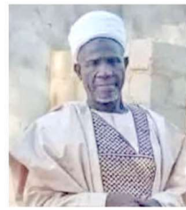
■ The late ward head of Shuwaka community