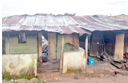
■ One of the burnt houses