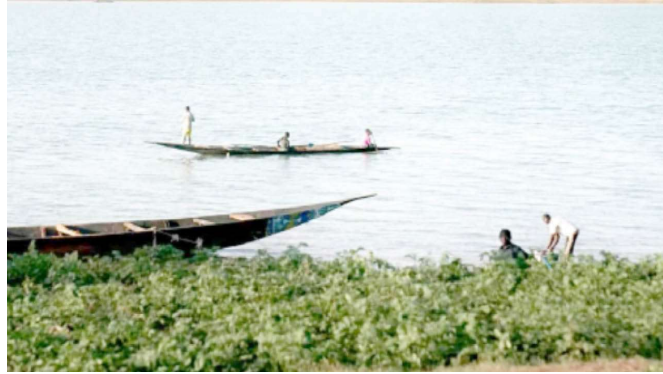
Kwara Waterways during the Patigi boat mishap recently