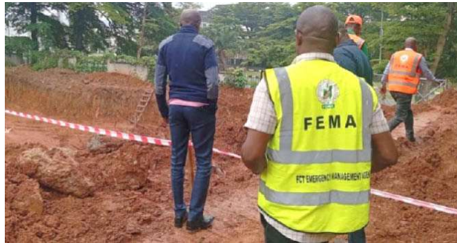
The scene of the accident