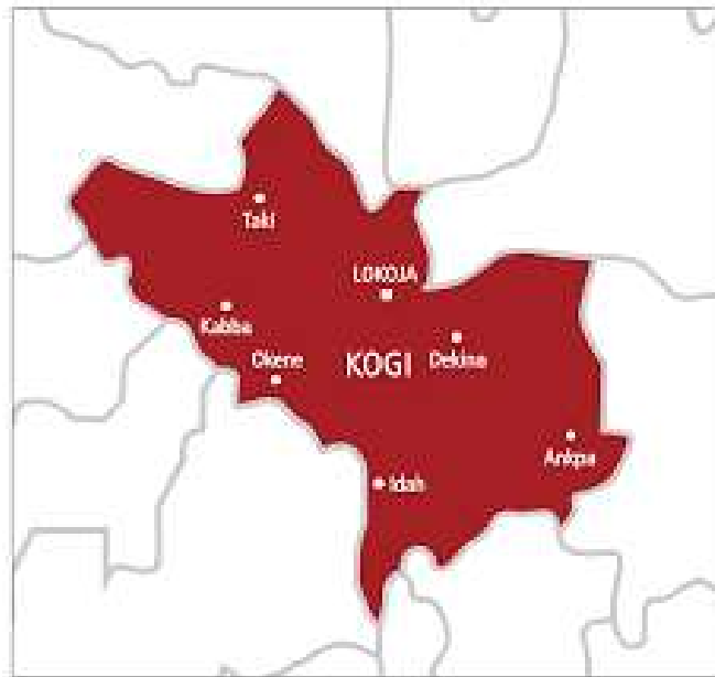
Kogi State Map