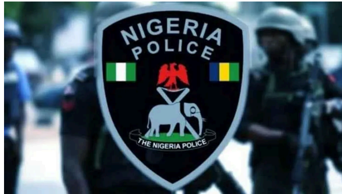
nigeria police force