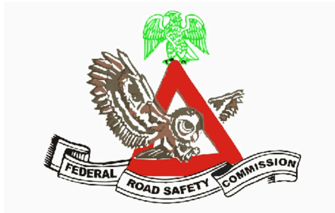
Federal Road Safety Commission