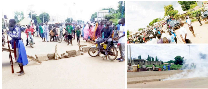
■ Protest after the mosque attack at Gidan Mantau Village of Malumfashi LGA, Katsina State, yesterday.