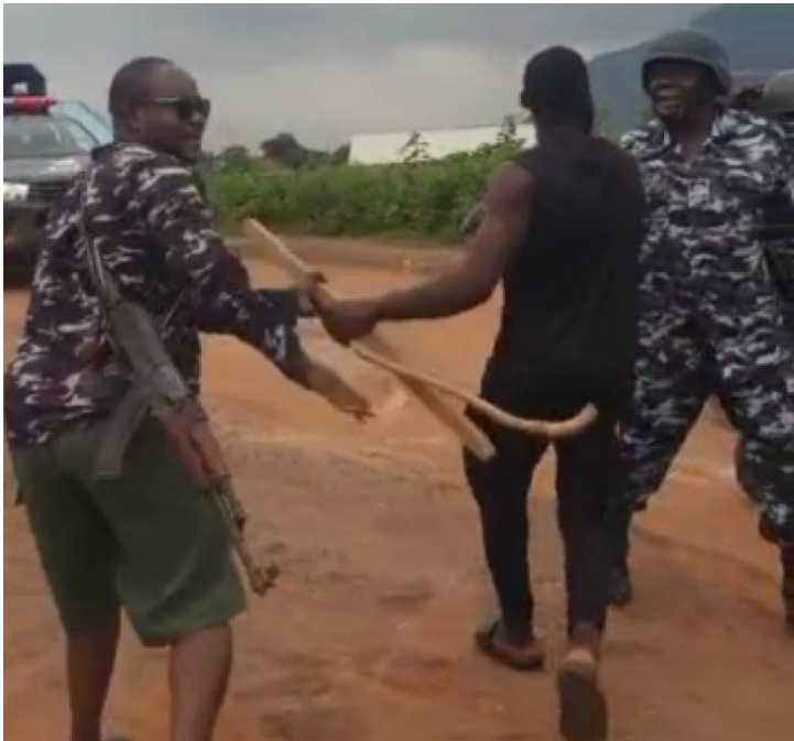
One of the natives being arrested by the police during the crisis