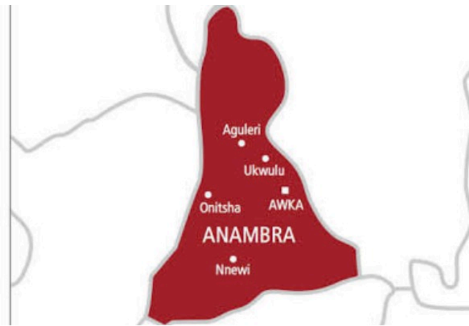
Anambra State Map