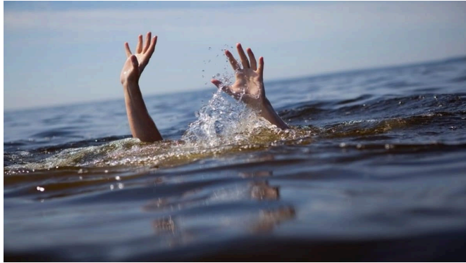
drownning drown man drowns in hotel pool