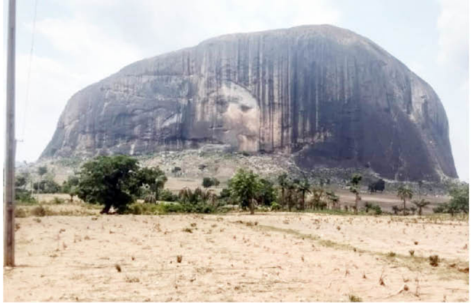
■ The disputed area said to be the boundary between the two states

1 killed, many injured as fct, niger fight over land