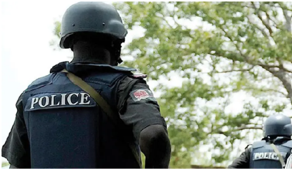
a nigerian police officer