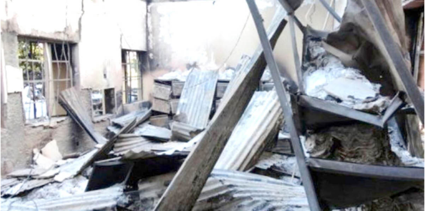
Houses destroyed during bandits attack in Azare, Bauchi State, recently