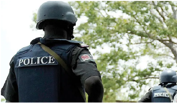
a nigerian police officer