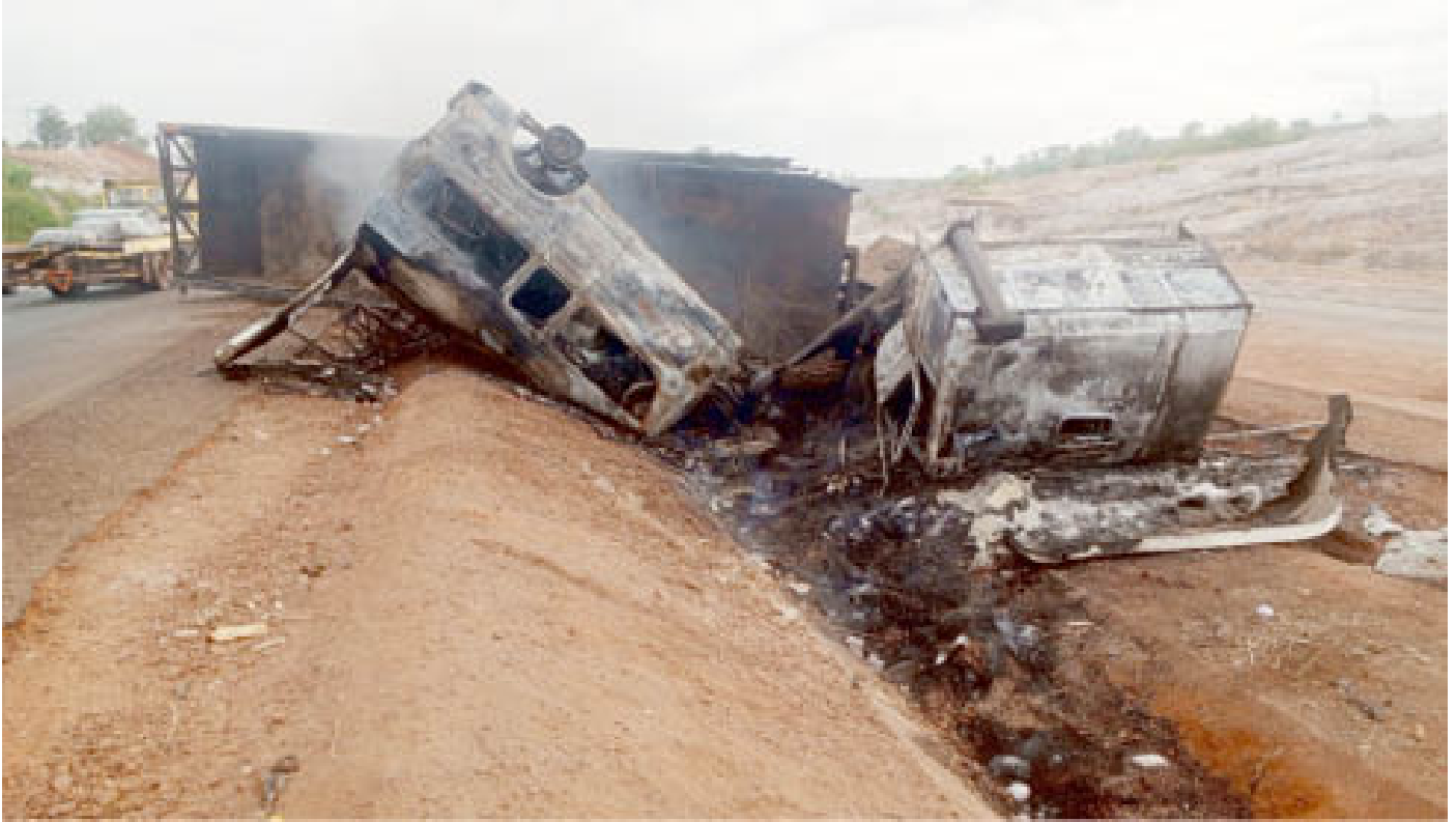
scene of the accident