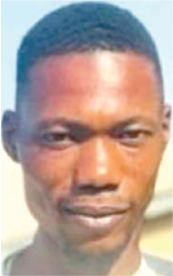
cover daily By Mumini Abdulkareem (Ilorin) & Idowu Isamotu (Abuja)