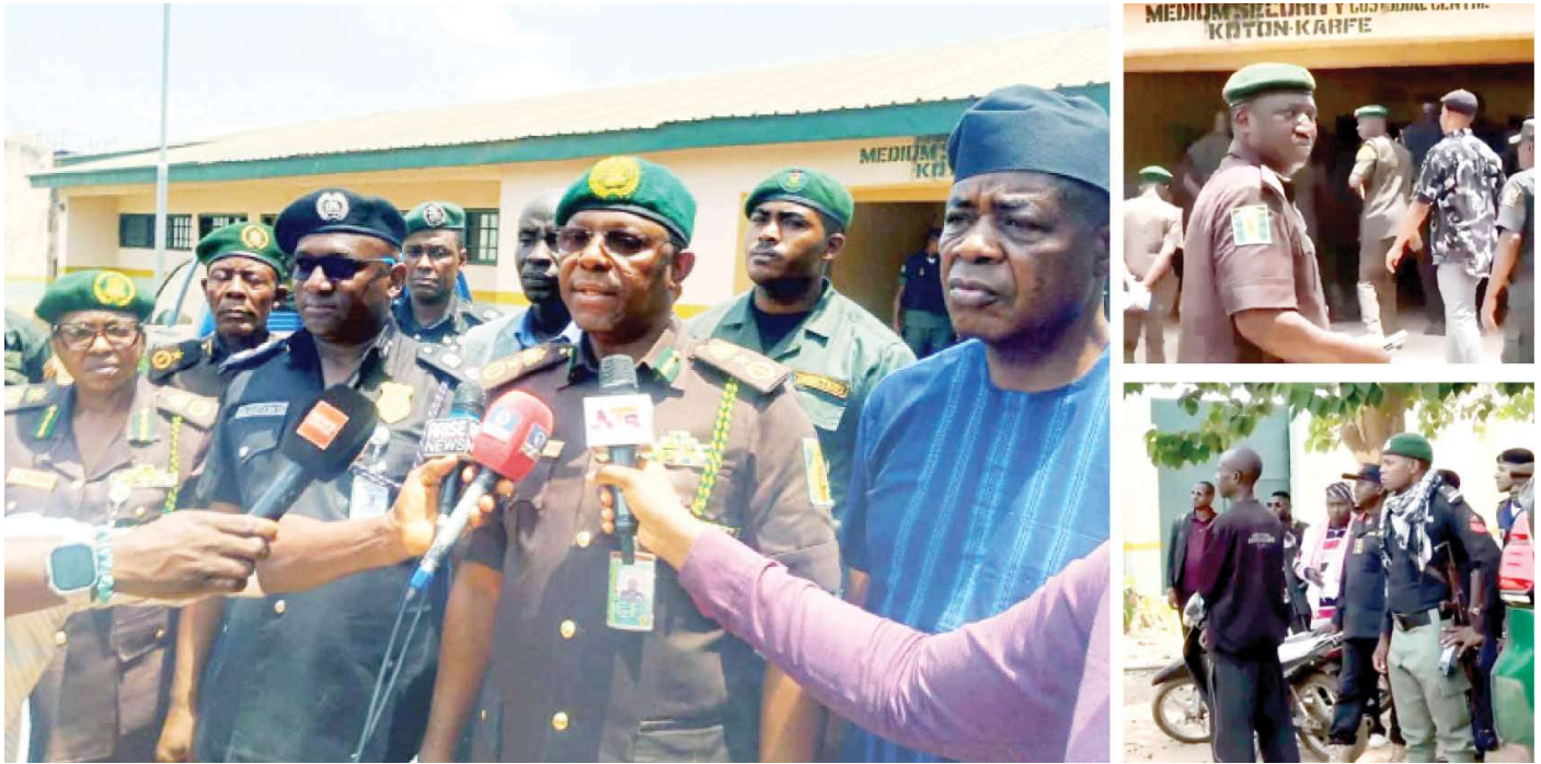
The Acting Controller General of the Nigeria Correctional Service, Sylvester Nwakuche (middle), during an assessment visit to the Koton Karfe Medium Security Custodial Centre, Kogi State, after the jail break on Monday.