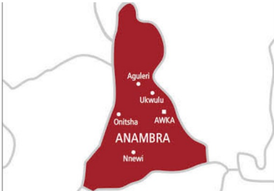
Anambra State Map