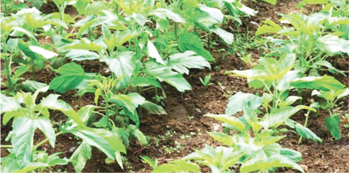
a sesame farm