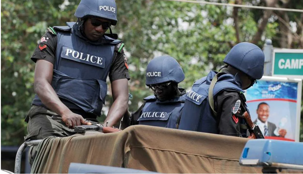
The Nigeria Police